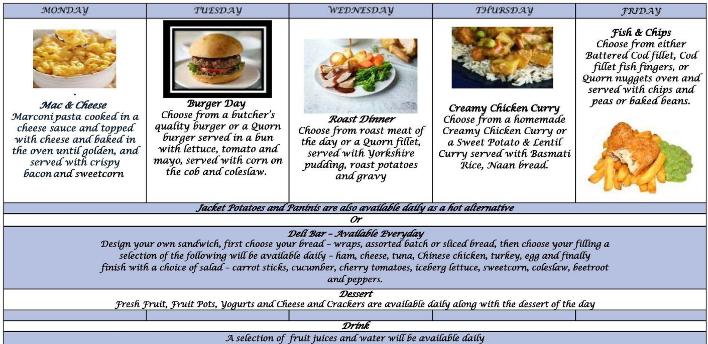
Dishes and their allergen content – New Brighton Primary School (Week 1 – Food Menu)