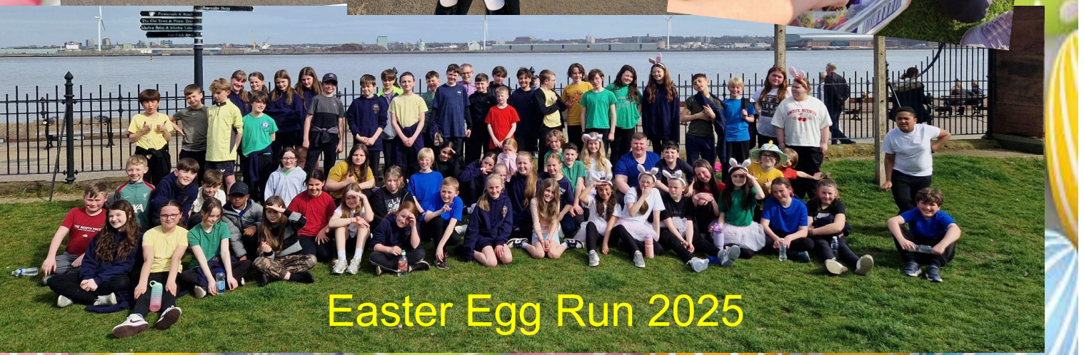
Easter Egg Run 2025