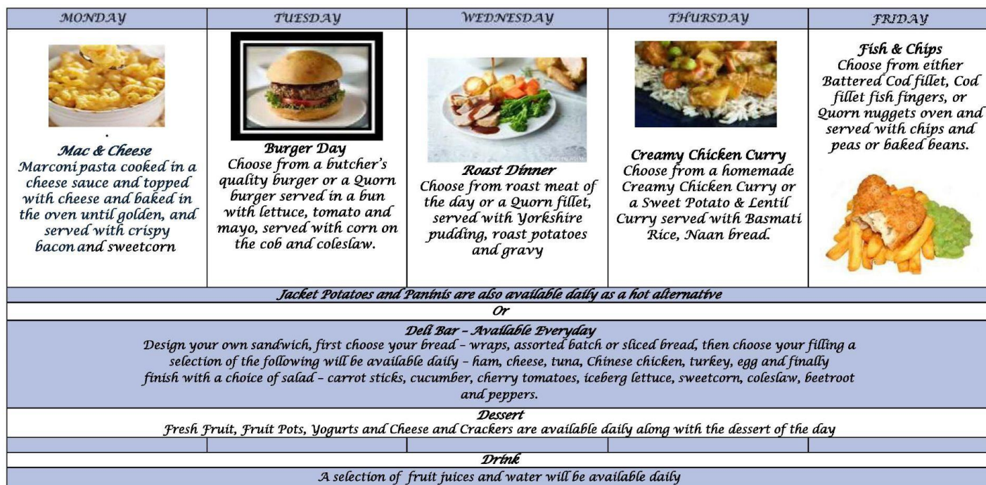
Dishes and their allergen content – New Brighton Primary School (Week 1 – Food Menu)